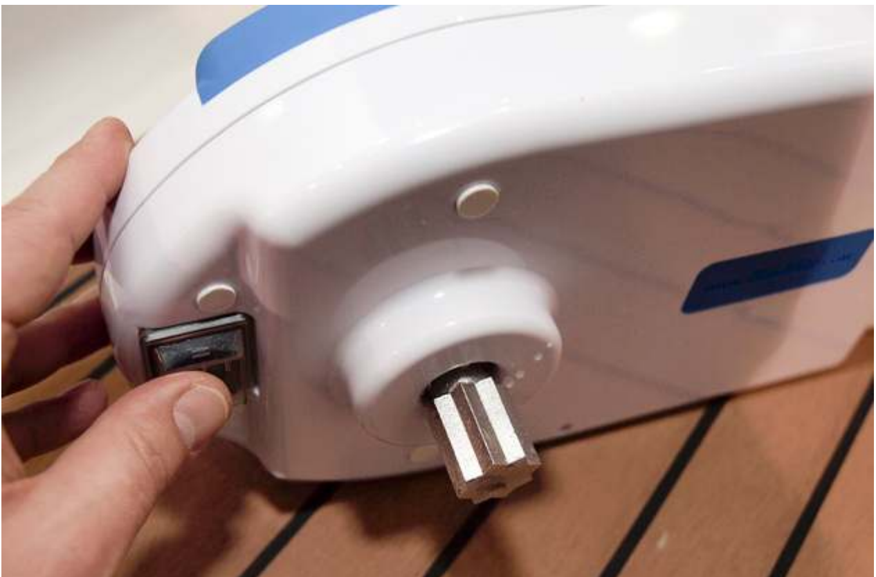
In order to also use two-speed winches can switch the direction of rotation