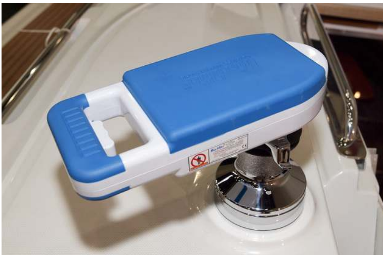
Battery Powered Winch Handle - WinchRite

02.03.2011 Hauke Schmidt, Photos: YACHT/ H. Schmidt - Electric winches increase the ease of a yacht, but a larger investment. Cheaper is with an electric crank.